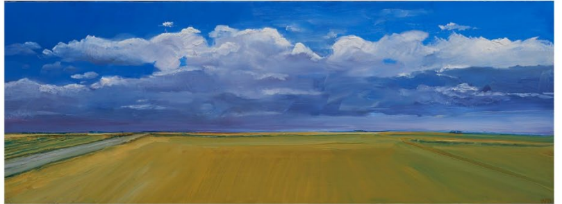
Wheat Field , 2023, oil on panel, 8 1/2 x 22 3/4 inches