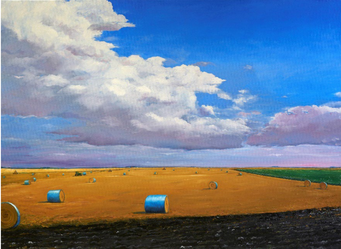
Blue Straw Bales and Plowed Field , 2024, oil on canvas, 72 x 99 inches

There will be a reception at Forum Gallery on Thursday, January 15, 2026, 5 – 7pm. The Artist will be present.