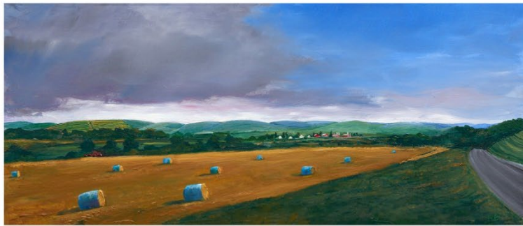
Bel Air Farm Summer , 2020, oil on panel, 9 3/4 x 23 3/4 inches