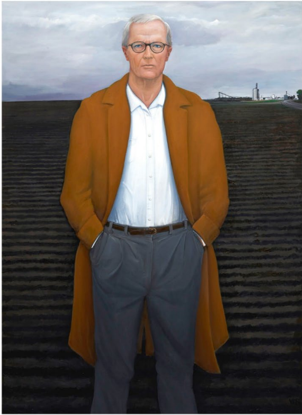
Overcoat with Plowed Field , 2018-21, oil on canvas 100 x 73 inches