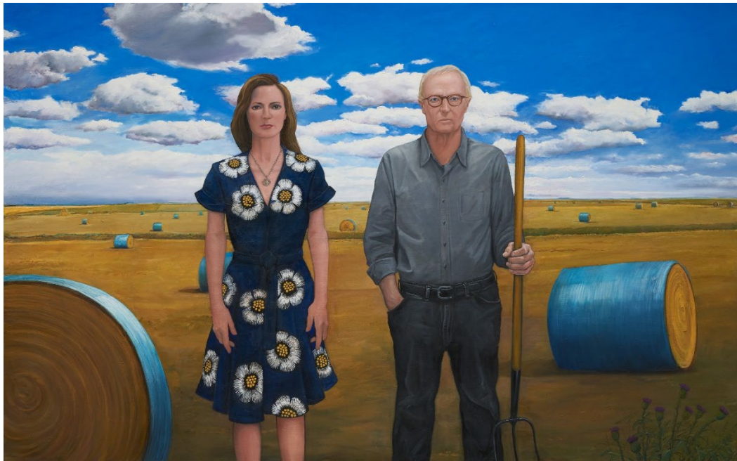
Straw Bales (Overcoat Series) , 2024, oil on canvas, 86 x 138 inches