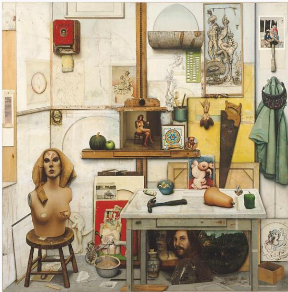
Gregory Gillespie, Studio Corner , 1983-86, oil, alkyd, acrylic, graphite, paper, wood, and collage elements on wood, 96 x 96 ¼ inches. The Metropolitan Museum of Art, New York.