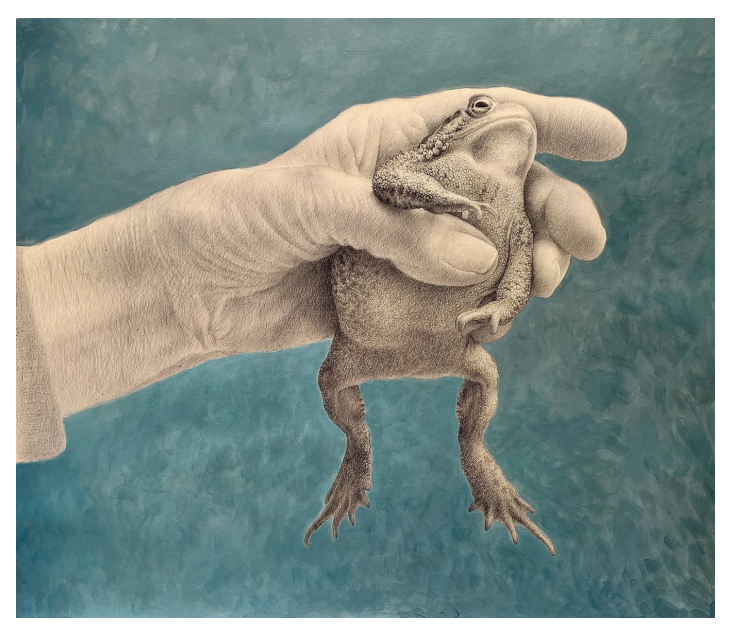
Wade Schuman Toad for Josephine , 2023 ballpoint pen and acrylic on prepared paper 30 1/4 x 37 1/8 inches