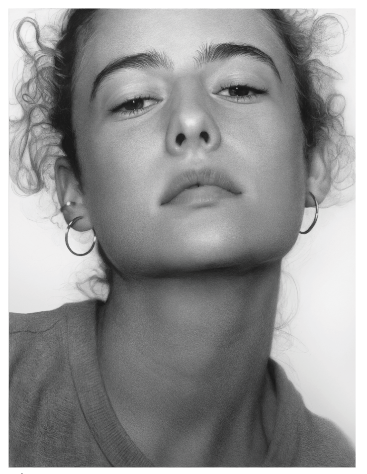
Clio Newton Luna , 2024 compressed charcoal on Legion Museum board 50 x 38 inches