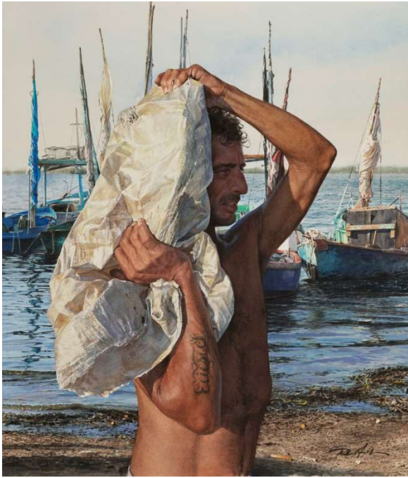
Rance Jones, Casilda Fisherman , 2018, watercolor on paper, 21 x 17 inches