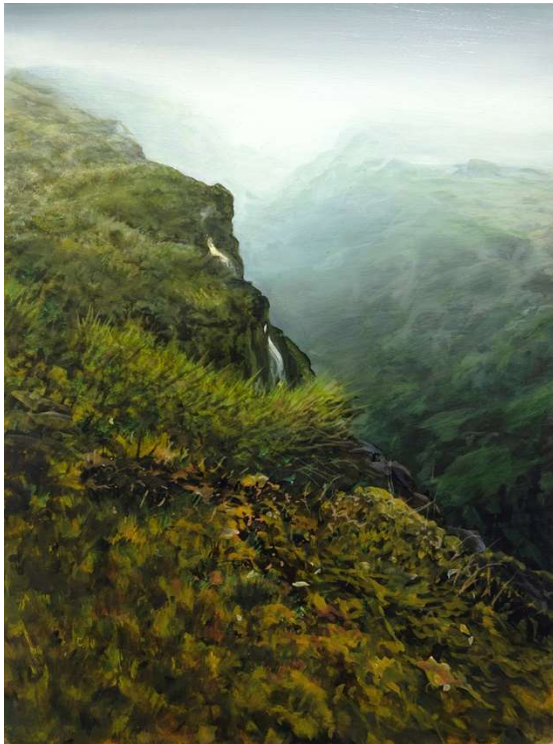
Tula Telfair, Worthy of Our Attention , 2022, oil on clayboard, 24 x 18 inches