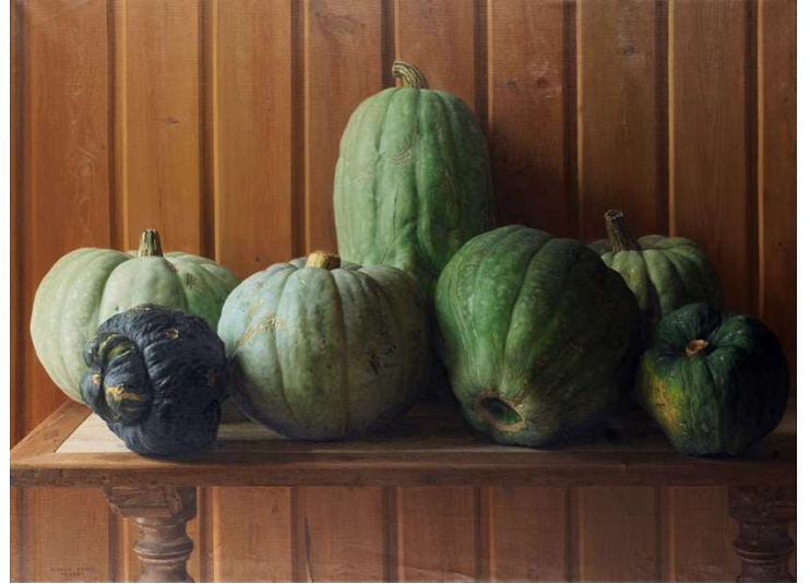
Claudio Bravo, Calabazas Verdes , 1992, oil on canvas, 38 x 51 inches