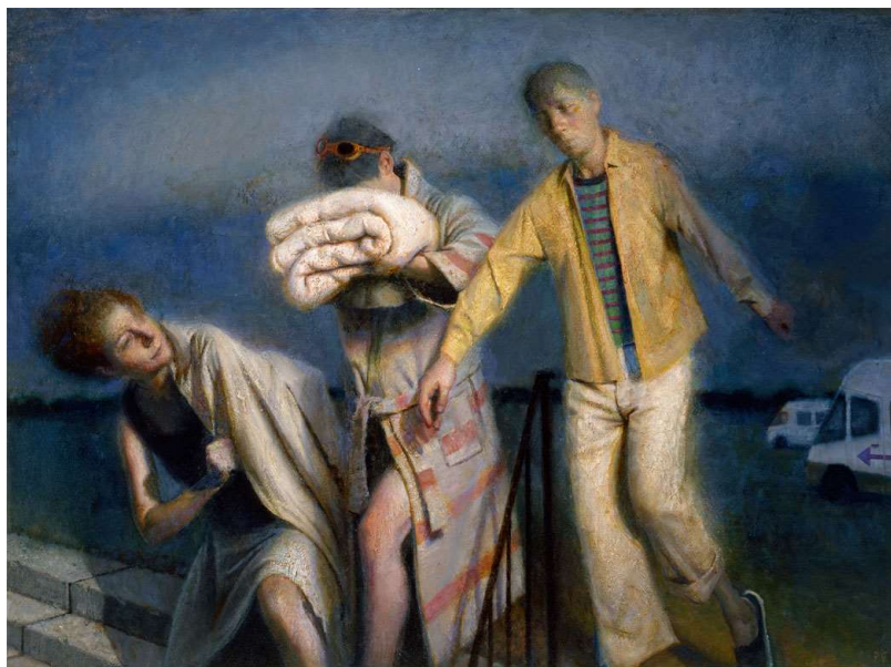
Paul Fenniak, Excursion , 2013, oil on canvas, 22 x 30 inches

New York, NY – Beginning July 25, 2024, Forum Gallery presents Out of Town , an exhibition about the human desire to escape our busy urban lives for the reverie of landscape vistas and seasonal adventures. By the hand of a diverse selection of visionary contemporary and twentieth-century artists, the twenty-nine paintings, works on paper, and textiles comprising the exhibition present visual interpretations of landscapes and nature's seasonal offerings inspired by natural subjects from coast-to-coast and faraway shores, as well as expressions of the artists' own personal introspection. Out of Town continues through Saturday, September 7, 2024.