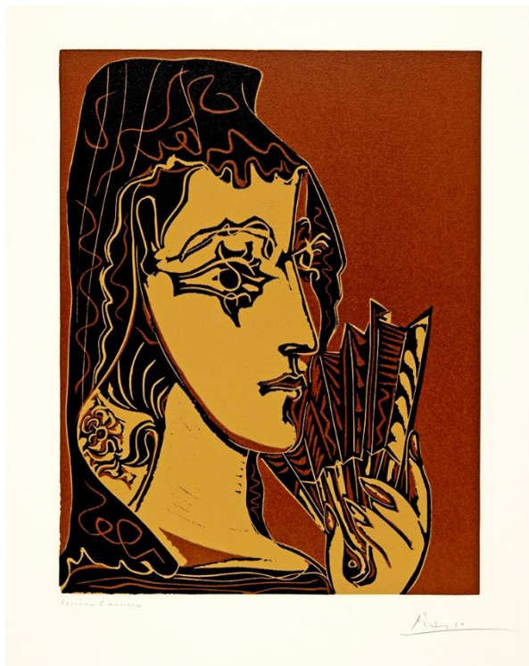
Portrait de Jacqueline en Carmen, 1962 linocut printed on wove paper with Arches watermark 24 5/8 x 17 5/16 inches One of approximately 20 artist proofs outside the Edition of 50, of the fourth and final black state © 2023 Estate of Pablo Picasso / Artists Rights Society (ARS), New York

Also included in the exhibition are carefully selected impressions from the quintessentially important series of prints created by Picasso over the arc of his artistic production: the Suite des Saltimbanques (1904-05), the Suite Vollard (1930-37), and the Suite 347 (1968).