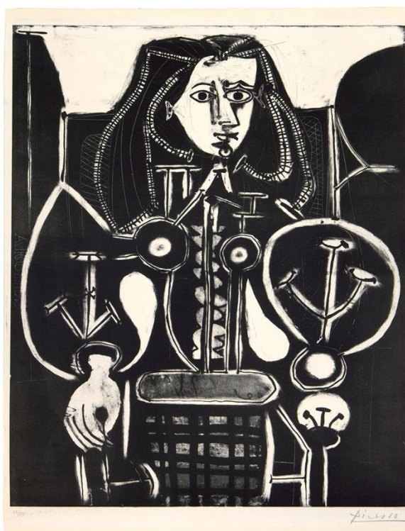
Femme au Fauteuil No 4, 1949 lithograph on Arches vellum with Arches watermark 30 x 22 1/4 inches Edition of 50, of the fifth (final) state © 2023 Estate of Pablo Picasso / Artists Rights Society (ARS), New York

Picasso's personal relationships heavily influenced the evolution of his work. The earliest work in the exhibition, Portrait de Femme , c. 1897, is a sensitive colored pencil drawing of a woman in the Picasso household created when the artist was just sixteen and still living in Spain; the intimate Visage de Marie-Thérèse , 1928, captures Picasso's famous "golden muse" in the early days of their relationship; an evocative ink drawing, Tête de femme (Dora Maar) , c. 1942, brilliantly captures Dora Maar with remarkable economy and is dedicated to Albert Skira, publisher of the journal Minotaure and fine art books; Françoise Gilot is depicted in