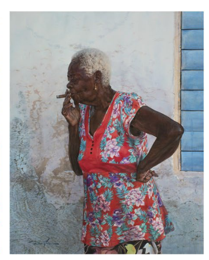
Fumando, 2022, watercolor on paper, 21 x 17 inches