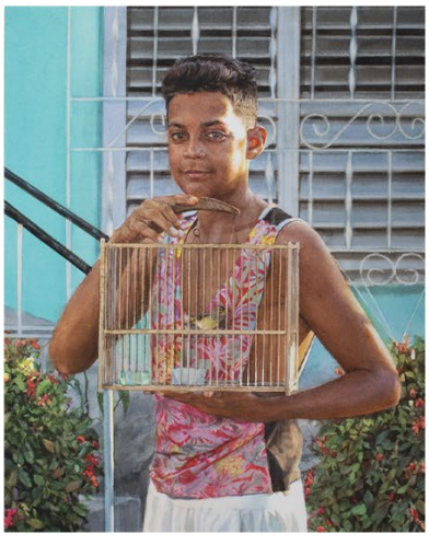
Close to the Heart, 2022, watercolor on paper, 12 ½ x 10 inches