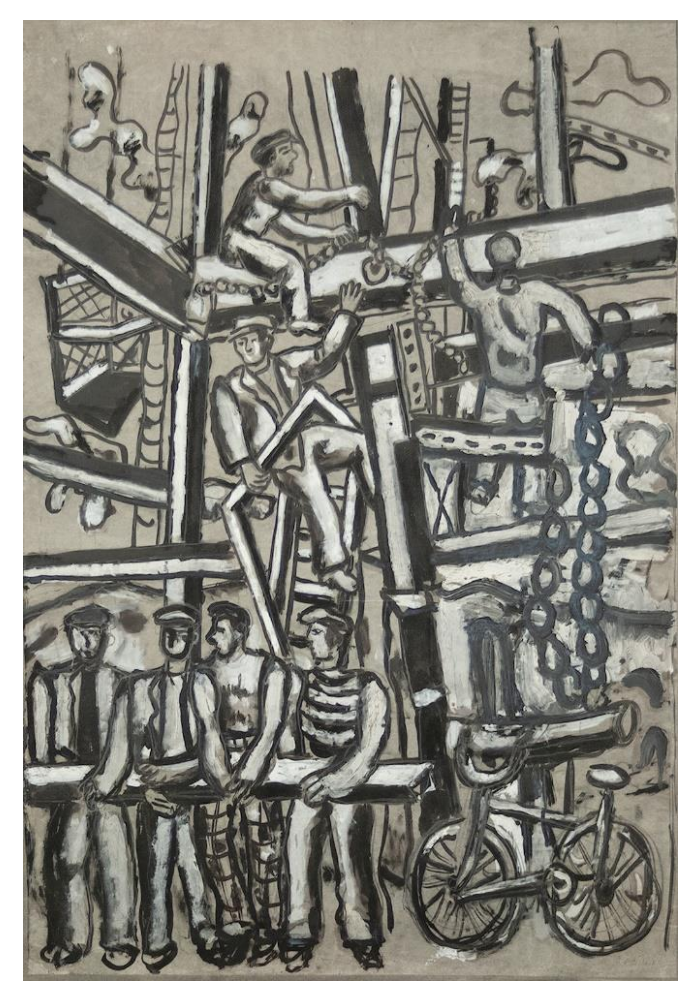
Fernand Leger, Étude pour la Grande Tour, 1949, gouache, ink, oil, and pencil on paper, 32 x 22 inches

New York, NY – Forum Gallery announces The Figure in Black and White , an exhibition of expressive figurative paintings, works on paper and textiles in grayscale by more than thirty artists from Modernist to Contemporary. The Figure in Black and White will be on view at Forum Gallery from Thursday, March 16 through Saturday, April 22, 2023.