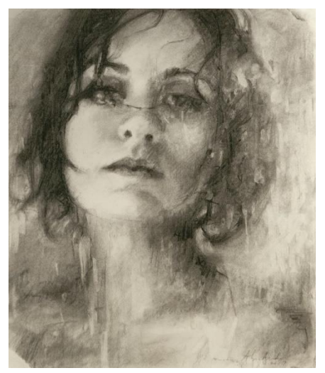
Alyssa Monks, Self Portrait in Charcoal, 2017, charcoal on paper, 12 x 10 inches