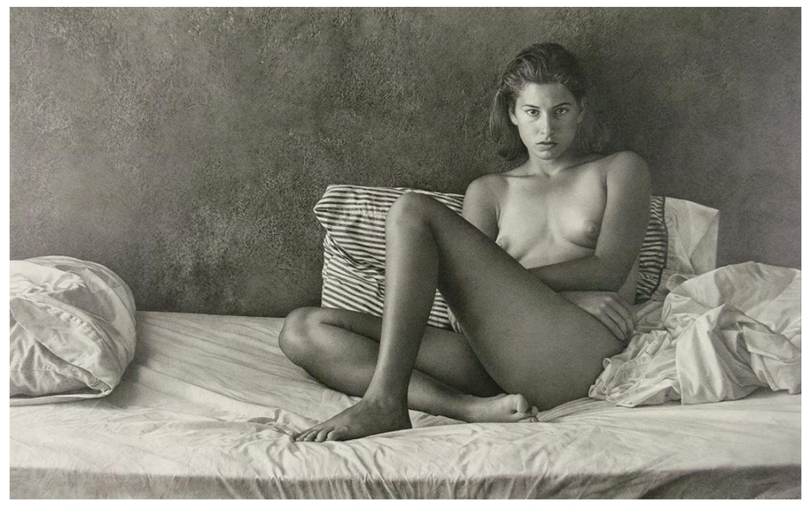
Kent Bellows, Megan: August 1995, 1995, graphite on paper, 18 x 28 3/4 inches

You are invited to explore our Online Viewing Room for The Figure in Black and White here: viewingroom.forumgallery.com/viewing-room/the-figure-in-black-and-white