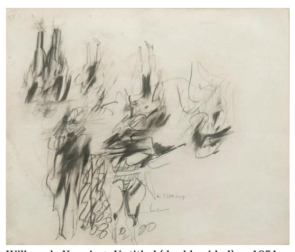
Willem de Kooning, Untitled (double-sided) , c. 1951, pencil drawing on paper, 14 x 16 3/4 inches