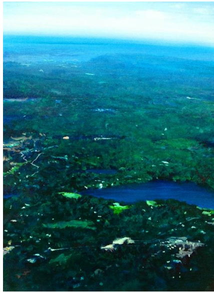
Remembered Landscape, 2022