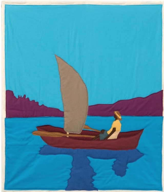
Da Boat, 2022, textile, quilting cotton and thread, 39 x 33 ½ inches