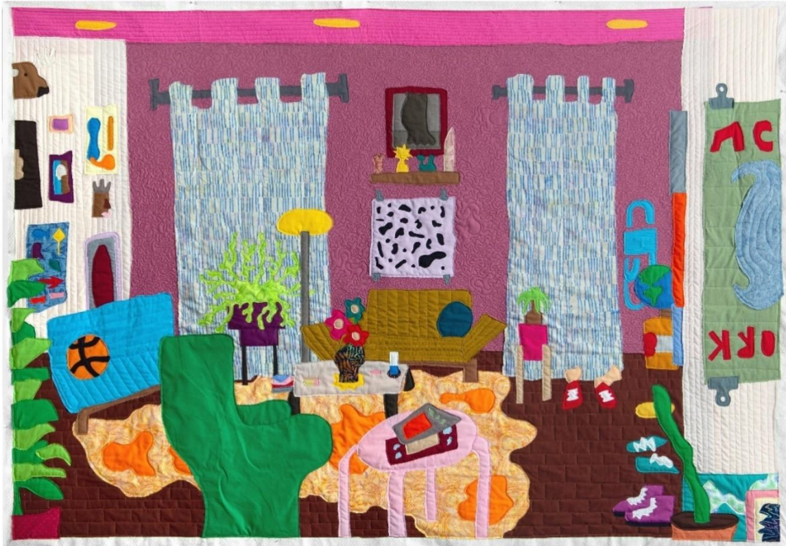
Gunther Place, 2022, textile, quilting cotton and thread, 60 ¾ x 85 ½ inches